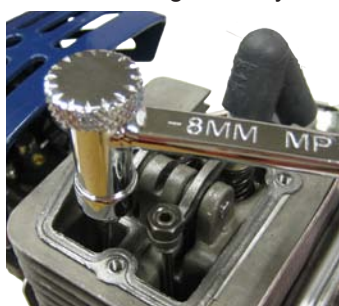
2510/3410 Series Valve Clearance: 0.004"

When to adjust? Rather than try to track actual hours on a C4 unit, we've seen this to be a very good rule of thumb: If the engine cranks over and starts easily, leave it alone. If hard to start, valve lash is worth checking. For 2510/3410 units, the combination of hard to start and hard to crank is the primary indication of the need to adjust valves. As valve lash increases, the decompression lobe eventually does not contact the cam and the recoil cord becomes significantly harder to pull.