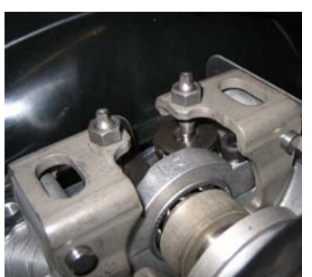
8510/8520 Series Valve Clearance: 0.002"

In the past, and on a limited basis, we've offered to provide the first valve adjustment for C4 units. Today, to continue that program invites a lower level of air filter maintenance and so is officially discontinued.